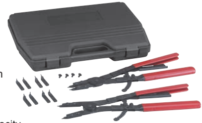
No. 4513 – Heavy-Duty Snap Ring Pliers Set.