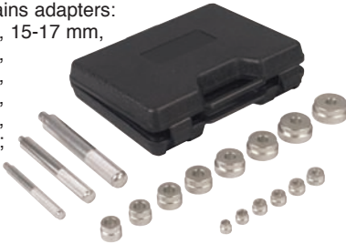
No. 4407 – Metric bushing driver set (14 piece).