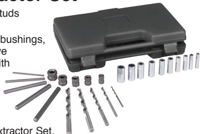
No. 4651 – Screw Extractor Set.