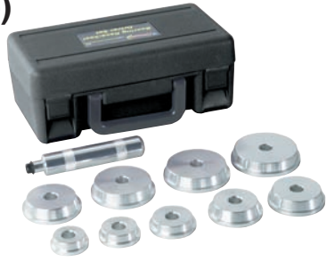
No. 4507 – Bearing Race and Seal Driver Set (10 piece).