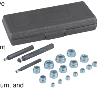
No. 4505 – Bushing Driver Set (19 piece).