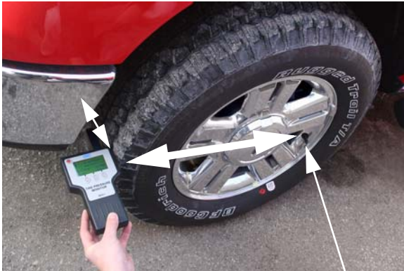
Tire Valve Stem