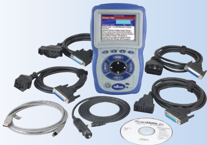
No. 3816 Scan Kit