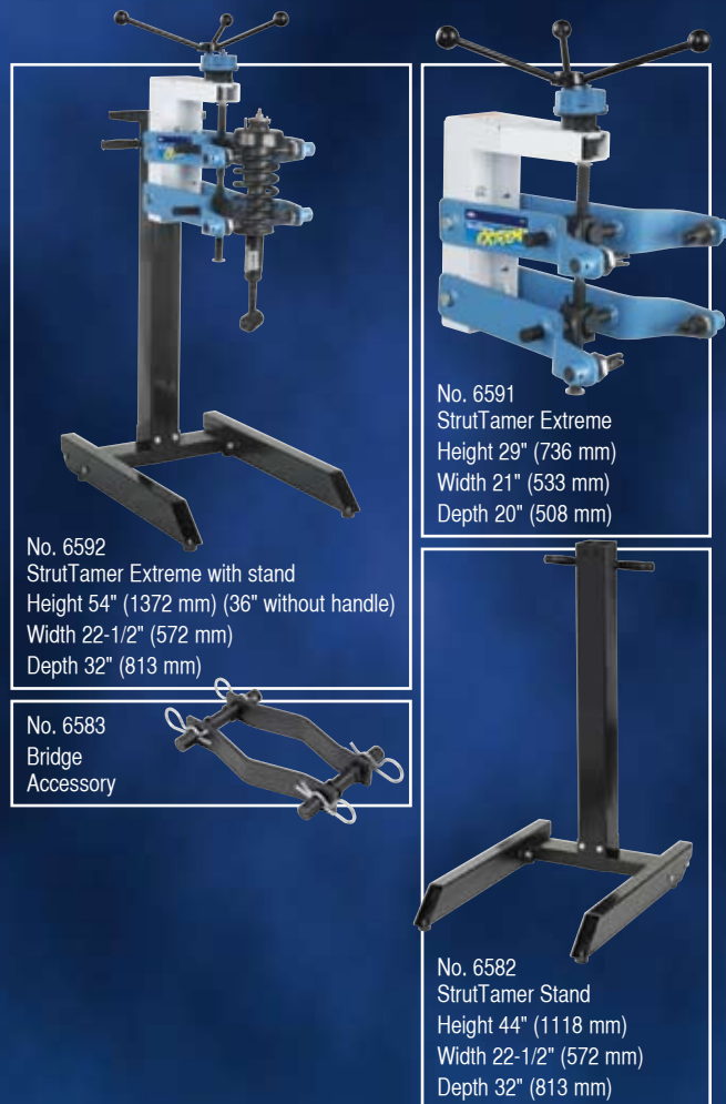
No. 6592 StrutTamer Extreme with stand Height 54" (1372 mm) (36" without handle) Width 22-1/2" (572 mm) Depth 32" (813 mm)